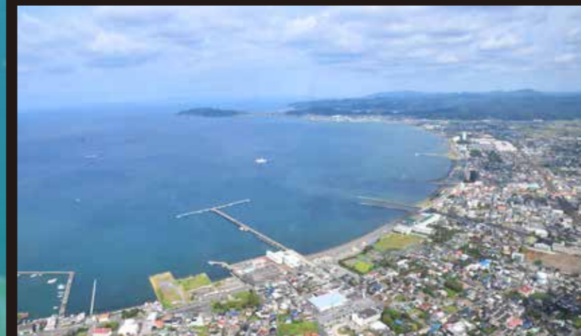
Hojyo Beach, Tateyama, Chiba