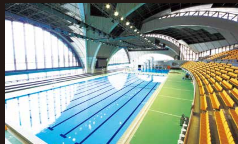
2-8-10, Tatsumi, Koto-ku, Tokyo